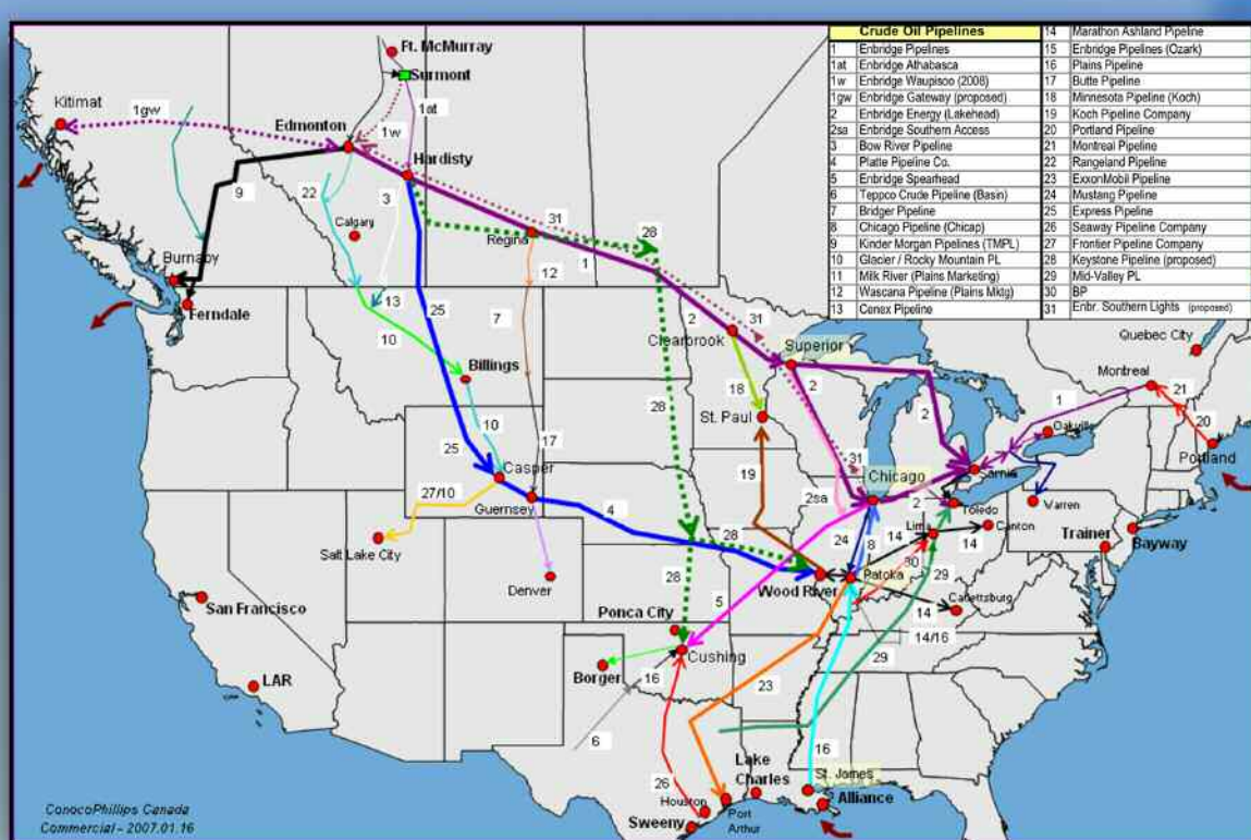
Western Canada to U.S. Crude Oil PL Systems